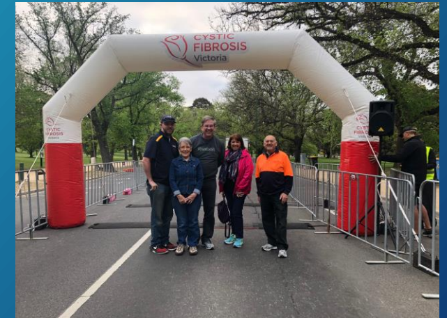
Well done to our Club Members who arose early on Sunday 28th October to cook the BBQ for the Cystic Fibrosis Great Strides Run or Walk around the Botanic Gardens.